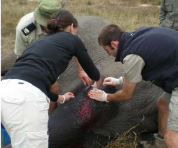
Flush F10SC: F10SC diluted 1:250 with clean water is used to flush the lanced abscess under pressure with a 50ml catheter-tipped syringe.

Under anaesthesia an incision was made at the most ventral aspect of the abscess and with artery forceps all the internal septae and compartments were broken down. It was vigorously flushed with F10SC, diluted 1:250 with clean water. Gentamycin antibiotic beads were prepared from a Demotec ® hoof repair kit (similar to polymethyl-methacrylate) and injectable gentamicin (50mg/ml) as a string on surgical nylon and were then subsequently sterilized with formalin gas.