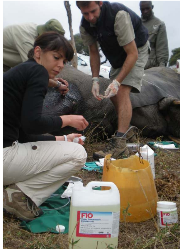
Products used during Thokwe's treatment.

In both these cases the original inciting cause of the abscesses is unknown. Both these elephants were trained elephants that were accustomed to daily handling and this allowed for easy administration of the F10 products. The failure of the earlier treatments might have been due to retained foreign material or necrotic sequestra, possibly inactivation of the compounds by means of purulent material and lack of adequate drainage.