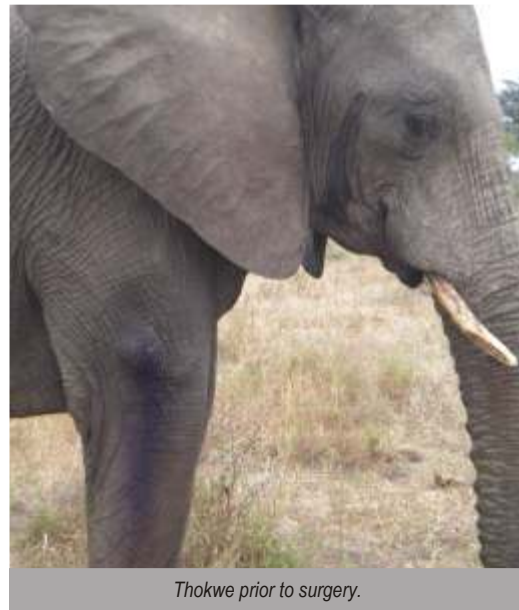
Thokwe prior to surgery.

Thereafter the F10 ointment was discontinued and flushing was only carried out once every four to seven days. Within three months the abscess had become unnoticeable and was no longer producing any discharge.