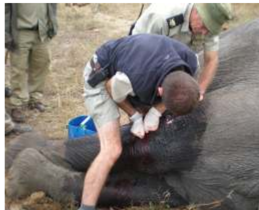
Breaking up abscess compartments: With a long artery forceps the inside partitions of the abscess were bluntly broken down to facilitate drainage and flushing.

Thokwe an adult cow approximately 24 years of age had a chronic non-healing abscess that had ruptured at its dorsal border and started dissecting underneath the skin on the right shoulder, also in the region of the triceps muscle. It had been treated with oral trimethoprim sulphonamides and with the same wound lavage solutions as Joe had been for approximately four months prior to our involvement. Due to its rapid spread and poor drainage it was decided to anaesthetize her with etorphine and azaperone.