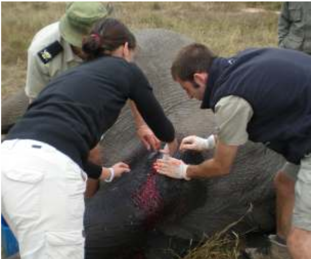
Flush F10SC: F10SC diluted 1:250 with clean water is used to flush the lanced abscess under pressure with a 50ml catheter-tipped syringe.

Under anaesthesia an incision was made at the most ventral aspect of the abscess and with artery forceps all the internal septae and compartments were broken down. It was vigorously flushed with F10SC, diluted 1:250 with clean water. Gentamycin antibiotic beads were prepared from a Demotec ® hoof repair kit (similar to polymethylmethacrylate) and injectable gentamicin (50mg/ml) as a string on surgical nylon and were then subsequently sterilized with formalin gas.